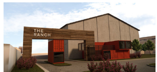
The Ranch Film Studio (Chalmette, LA) Located in the heart of the Central Business District.