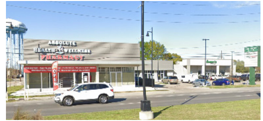
The Front Retail Center (Arabi, LA) Includes grocery store and pharmacy.