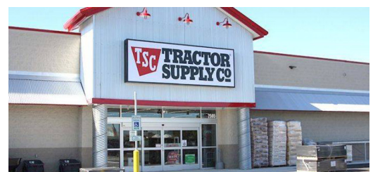
Meraux Retail Center (Meraux, LA) Includes neighborhood Walmart, Tractor Supply Co. and Taco Bell.