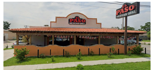
El Paso Mexican Grill (Chalmette, LA) Located on the Judge Perez Corridor.