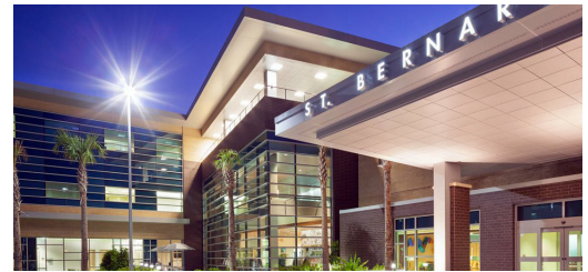
St. Bernard Parish Hospital (Chalmette, LA) Managed by Ochsner Health System