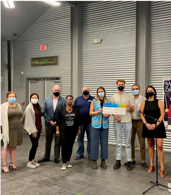
Glass Half Full won the grand prize in SBEDF's 2021 Startup St. Bernard competition.