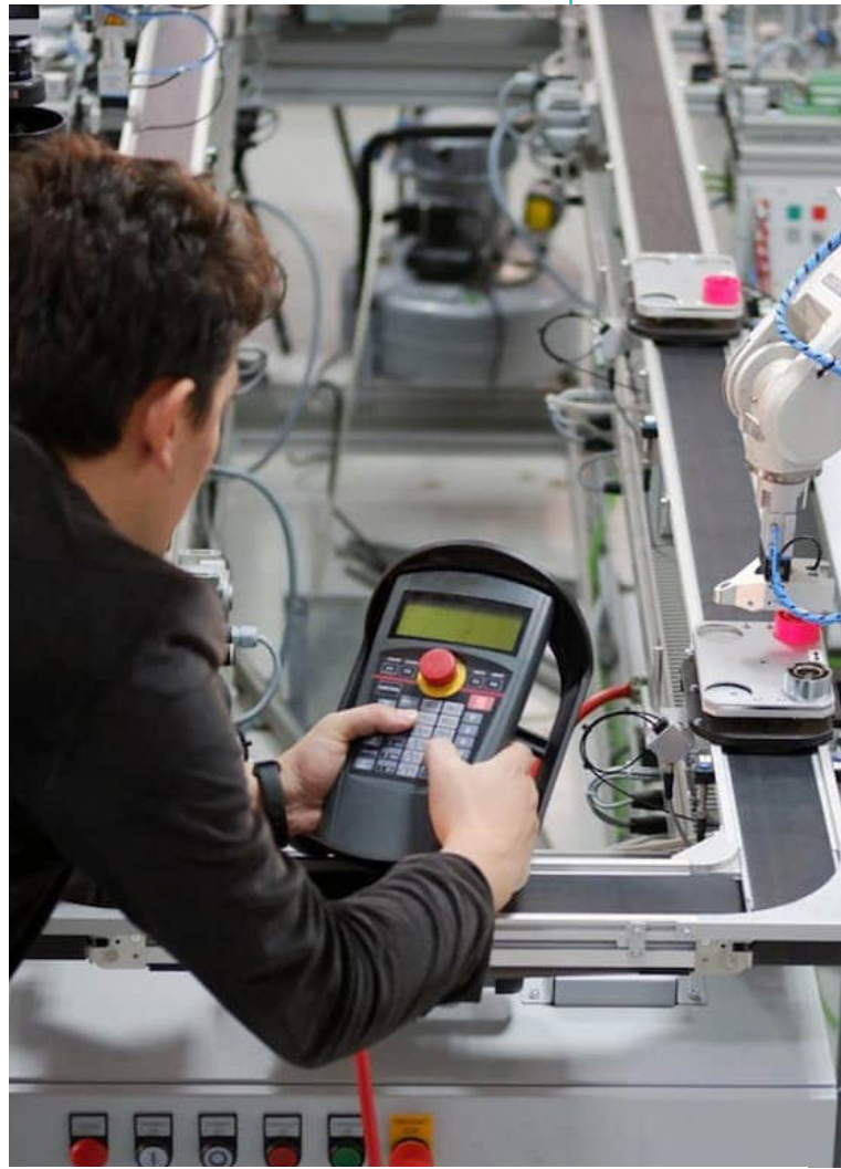
In 2021, Nunez Community College piloted a Mechatronics Apprenticeship Program.

In addition to post-secondary education initiatives, SBEDF has partnered with a variety of organizations that are creating career pathways and workforce experiences for high school and nontraditional students. In the summer of 2021, SBEDF hosted four interns from New Orleans public high schools through YouthForce NOLA. These interns gained real-world work experience and exposure to the field of economic development while strengthening soft skills such as communication, personal mindset, and time management. SBEDF has also developed a partnership with Take the Lead NOLA to employ people with disabilities in the parish and help employers receive support and incentives for doing so. Finally, SBEDF continues to work with Chalmette High School to bring programs such as Microsoft's TEALS computer science courses to CHS classrooms.