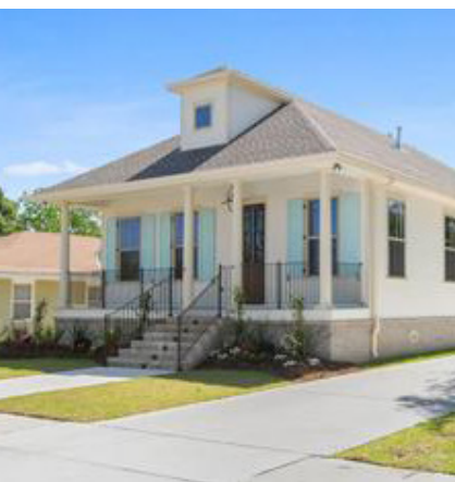
One of several homes featured in the St. Bernard Parade of Homes

As a central pillar of SBEDF's role in the parish, our team works alongside large and small businesses who are looking to relocate to or expand in St. Bernard. In 2021, SBEDF successfully partnered with over 10 companies to assist in their expansion efforts. Some notable business developments include: The Ranch Film Studios expansion, which added 11 new jobs paying an average salary of $51,818 plus benefits; Shibusa Systems' 13,000 square foot warehouse expansion; Outlet Deals Retail Center, and Planet Fitness' Chalmette location which included a $750k investment in facilities improvements and employs 12 people. These are just some of the incredible businesses who opened their doors this year, with over 24 ribbon cuttings held for new businesses in the parish.