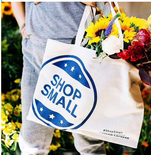
Shop Small participants each received a reusable tote.